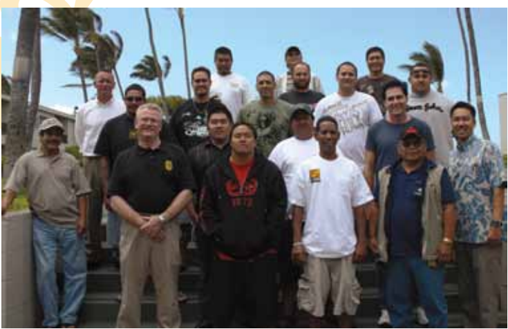
Maui TEAM participants. Bottom photo: Oahu TEAM participants